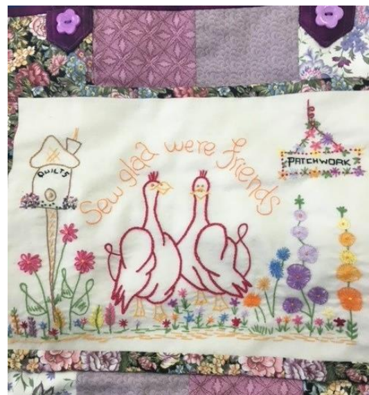
PICTURED: Hand Embroidery by Cheryl Hobley

Class 28 Computerised Machine Embroidery Any article featuring machine embroidery using fully computerised designs.