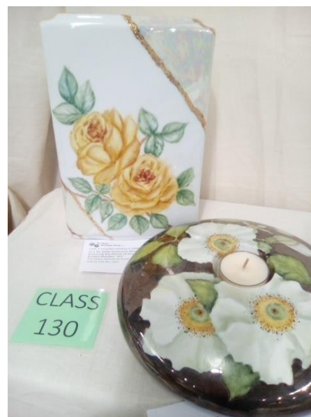
PICTURED: past exhibits of Porcelain Painting Artist Unknown at time of printing