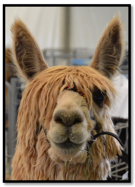
Albany Agricultural Show November 10<sup>th</sup> and 11<sup>th</sup>